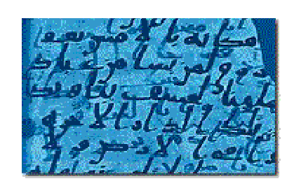
A page from perhaps the world's oldest extant Koran, from before 750 A.D. Ultraviolet light reveals even earlier Koranic writing underneath.