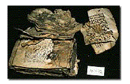
Yemeni Koran Fragments, as they were found in 1972.